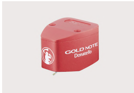
DONATELLO RED MC High Output Phono Cartridge