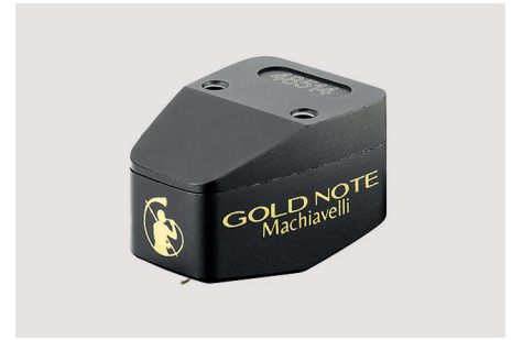
MACHIAVELLI MKII GOLD MC Low Output Phono Cartridge