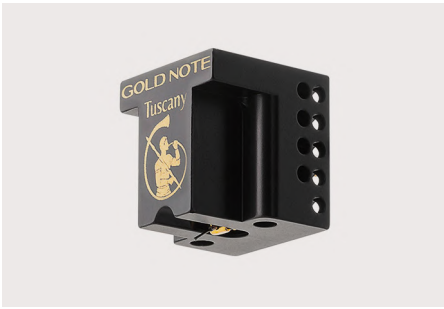
TUSCANY GOLD MC Low Output Phono Cartridge