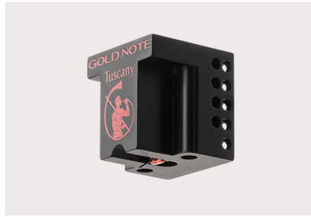
TUSCANY RED MC Low Output Phono Cartridge