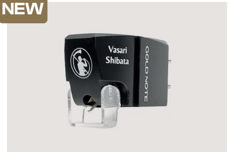
VASARI SHIBATA MM Phono Cartridge