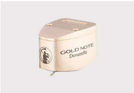
DONATELLO GOLD MC Low Output Phono Cartridge